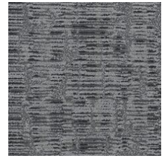
Silver 01535 LRV 13.2